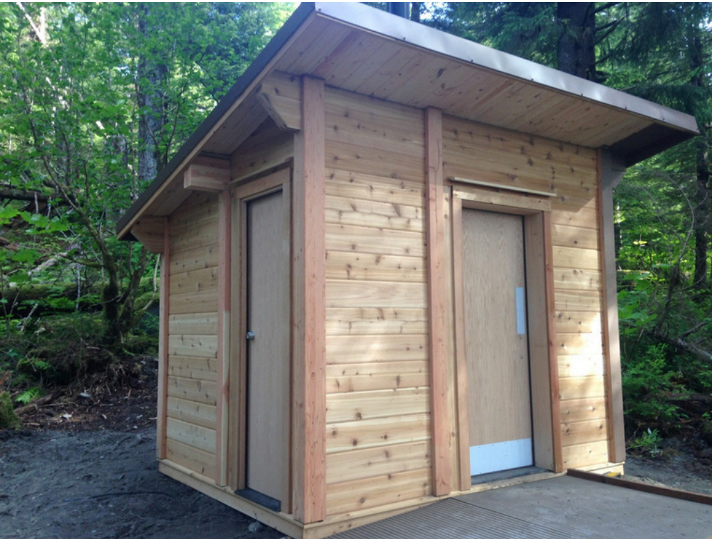
Glacier Bay National Park, AK Single Stall - ADA - 48" DCV - Decompose